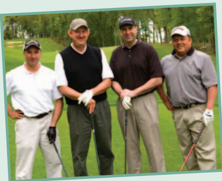
Transitional Data Foursome at Charter Oak Country Club in 2007.